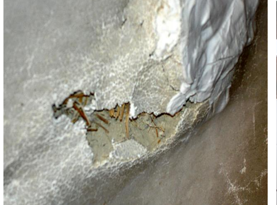
Figure 10. Interior space plaster - Sipahioğlu Mansion.

The most widely applied plaster technique in the rooms is "lath-and-plaster" which is known to be a significant application technique in Turkish architecture. It is the technique of applying plaster on laths which are horizontally hammered in 1-2 cm gaps onto stone or brick filled wall in between wooden carcass [16]. Allowing the shaping of a plastic form, it has been used in the formation of curvilinear surfaces. The places it has been used most widely are curvilinear ceilings of room entry as well as curvilinear intersection points on ceiling and wall joints (Fig. 11). Also, as stated above, in stone furnaces clayey mortar has been employed to join the stones with each other.