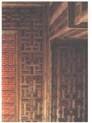
Figure 5. Ceiling illustrating Kundekari technique - Emirhocazade Ahmet Bey House [3].

Analysis of Interior Space of a Room in a Traditional Turkish House with respect to Construction