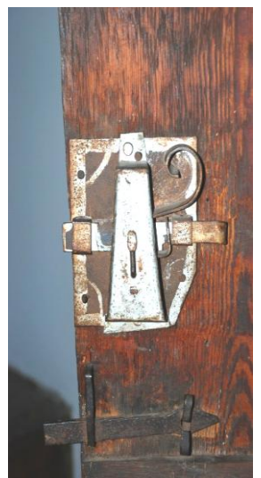
Figure 14. Use of metal material as lock and pusher on door - Kaymakamlar House.

6.7. Textiles and the places they are used