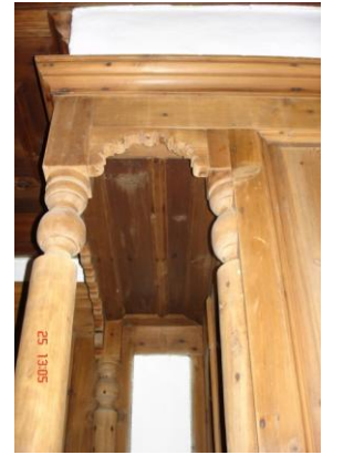
Figure 7. A separator reflecting "Hırhırcı" workmanship- Kileciler House.

Another noteworthy technique is "citakari" (ceiling ornamentation) which means connecting wooden pieces by nails. This technique has been employed particularly in wall panels, decorations in ceiling and ceiling center. The thickness of partition joints is around 1,5 cm. Profile or reglet has been opened in partition joint edges (Fig. 6, Fig. 11). On accounts of being a forested region, lathe workmanship also known as "hırhırcı" (noisy work) by locals is rather developed throughout the region. It is known that master builders in this region used to work in lathe ornamentations of traditional Turkish houses or in other cities like well-recognized city Beypazarı. Horizontal axis wooden lathes widely applied in Ottoman architecture were used in those houses as well. This forming method has been followed in window guards, separator and closet parapets (Fig. 7). Saw carving and chipping are the most widely used techniques in the interior space design of room. Tree is cut with various saws, dressed and shaped. This method has been applied on door coves, furnace arches, niches, window guards, seperator, parapets, closet, door and window frames (Fig. 8).