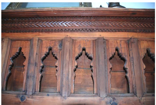
Figure 8. Niches constructed via saw carving and chipping technique - Kaymakamlar House.

In Safranbolu region house, physical quality of wooden material-breathing and cleaning the air insideenabled a continuous and natural air circulation throughout the structure. Due to dense usage of wooden material in room formation the air inside the room is freshened by exhausting moisture, odor and gases inside the space. As an outcome of water absorption quality of wooden material, there is no perspiration on room walls. Since wooden material provides a high level of heat insulation, the houses in the region offer cool comfort in summer and warm comfort in winter. No continuous heater has been needed inside. Rapid balancing of surface temperature with air temperature slows down the air circulation inside the room. Therefore parallel to the lessened air circulation the ratio of dust in the air also decreases.