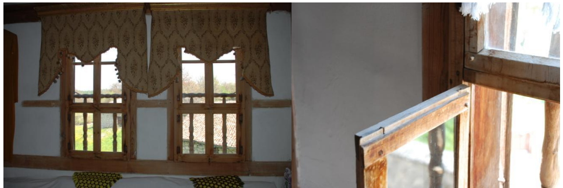
Figure 4. Window formation and details inside the room - Juruk village Sucu Hafiz house.