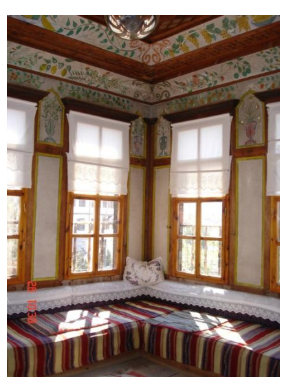
Figure 13. An interior space of room enriched by hand-carved works and textiles- Sipahioğlu Mansion.