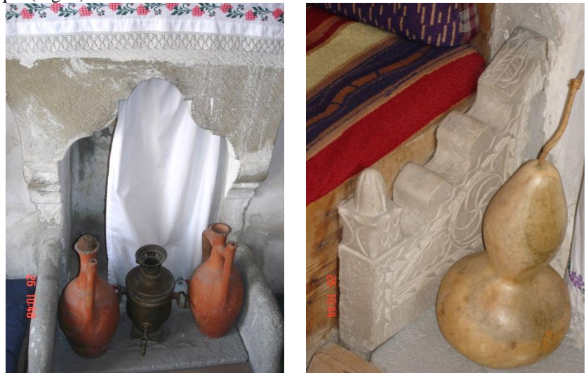
Figure 9. Furnace samples illustrating stone carving and engraving techniques- Sipahioğlu Mansion.

the biggest threats. Due to that reason, being nonflammable and fire-resistant, stone material has mostly been applied in and around furnace. Throughout the region, as connectors between the stones forming furnaces, clayey mortar including hays and plasterer's hair has been employed. Stones have been formed via carving and engraving technique (Fig. 9).