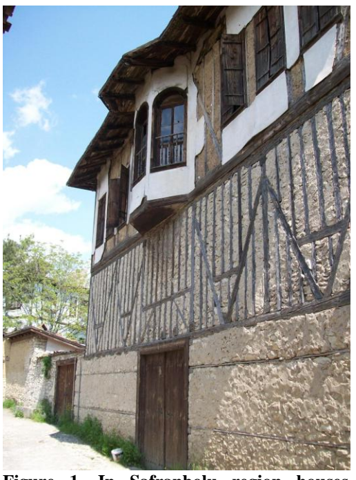
Figure 1. In Safranbolu region houses ground floor is masonry and upper floor is wood carcass. In some samples façade is coated.

Of the houses which are structured in exterior and central sofa plan types within the traditional Turkish house plan type classification, ground floor is masonry and upper floor is wood carcass termed as "hims" (Fig. 1). Façades of some houses are covered by coating known as "lath-and-plaster". The houses are mostly two or three-storey. Number of rooms varies from five to eight. In big mansions, there is an interim floor with a lower ceiling used in winter to heat the surrounding more comfortably. Comprising the most ostentatious rooms, upper floor which is directed towards the street with balconies, is the main living space of the house. There is also a pool in one room of some rich mansions which functions to cool the interior space in summer. Grounded on religion and tradition, in houses of the rich, there is a division as "selamlik" for men and "harem" for women. Although above-stated features are common in almost all Safranbolu region houses, there are also dissimilar and unique samples particularly with respect to construction materials used in the formation of interior space and application techniques.