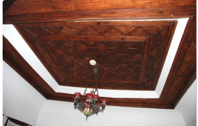
Figure 11. Lath-and-plaster workmanship of the ceiling representing Citakari artisanship and its joint with the wall - Kaymakamlar House.