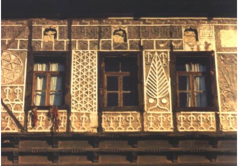
Figure 12. Application of Malakari technique on the façade of room - Mektepçiler House. [3]

This white colored, inorganic binding plaster material has been used in places which have no water contact since it is not a water-resistant material. It has been used on wall and window decorations in particular. On plastered surfaces of wall and furnace hoods, it has been illustrated with geometrical patterned reliefs. The same technique- termed as "malakari" (sgraffito) technique- can also be viewed on façade ornamentations. In Ottoman architecture Malakari is a decoration technique containing gypso-plaster and paint and applied on dome, ceiling and walls [16]. In Safranbolu region houses, there are some samples of colored malakari workmanship on the side of room facing façade (Fig. 12). Furthermore, plaster has been used on ceiling windows inside the room. Despite the existence of construction elements contacting exterior wall and window water, since wide eaves of house prevented the contact of water with these elements, plaster was liberally used. Of the ceiling windows, main framework is wooden and inner records are plaster. In the formation of these plaster records; die casting method has been applied. In this application, the number of windows, refinement of the ornaments on window and skills of the artisan bear great significance. Stained-glass workmanship has been conducted via small colored glasses located within plaster record thus the light entering interior space has been controlled.