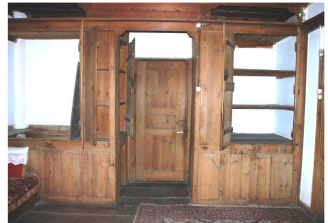
Figure 3. Formation of closet and door inside the room - Kileciler House.